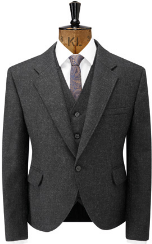
KILT JACKET — 6KJ

A 1 Button Jacket, with 3 Button Shams and Flap Pockets