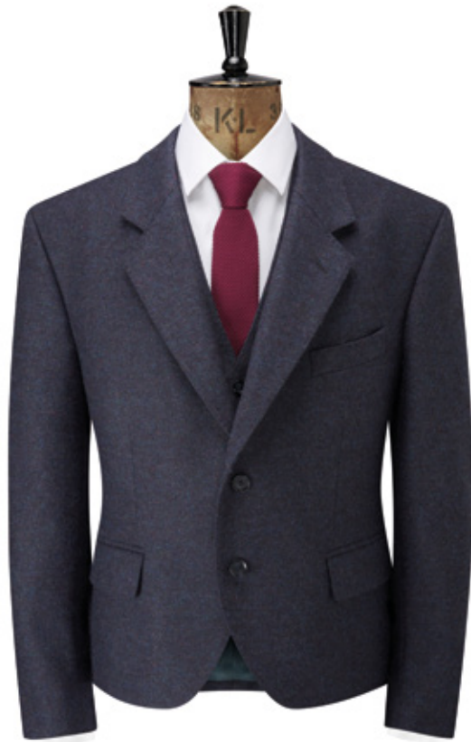
KILT JACKET — 2KJ

A 1 Button Jacket, with 3 Button Shams and Flap Pockets