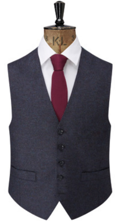
WAISTCOAT — KV1