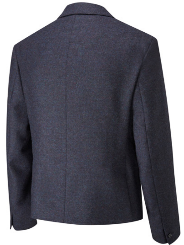
BACK OF THE KILT JACKET

A 2 button jacket, with 3 button shams and flap pockets